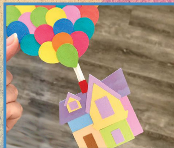
House Paper Craft